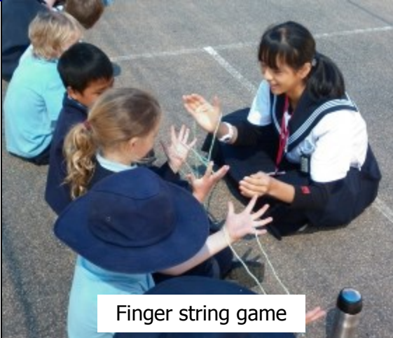
Finger string game