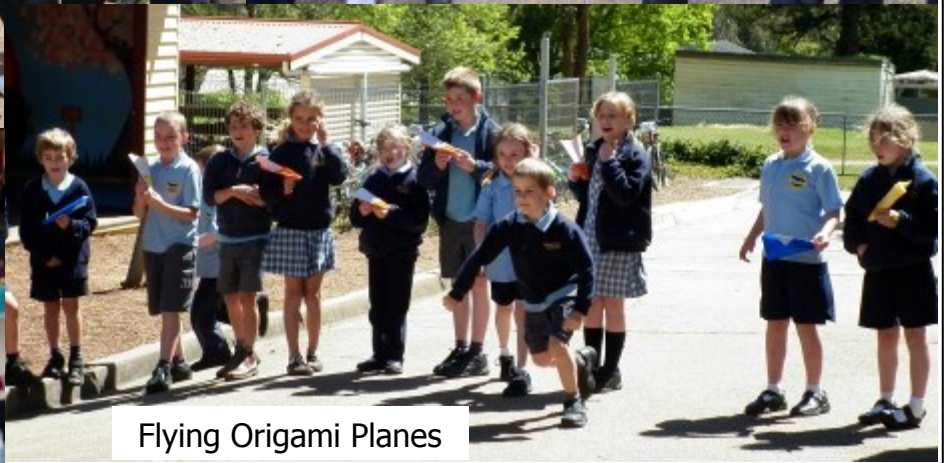
Flying Origami Planes

"Bright P12 College is a child Safe School. We promote the inclusivity and diversity of all students and school community members".