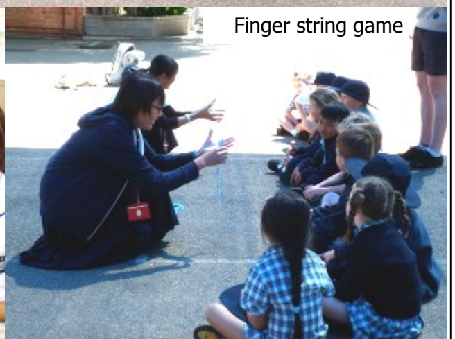
Finger string game