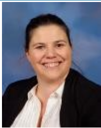
Assistant Principal's P-6 Report

Welcome back for another term. Although this term is a quiet one in regards to camps, there are some great learning opportunities coming up for our Primary students. We have Grip Leadership for Year 5/6s, Alpine Cross Country at Porepunkah, 3/4 Unit Cooking and we are finishing off the term with Shakespeare .